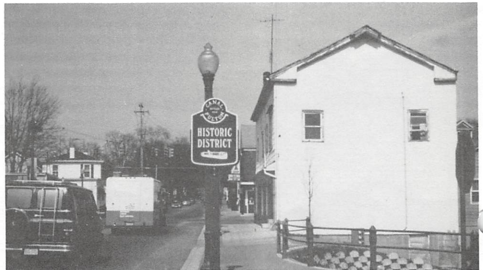
Canal Fulton is part of the Ohio and Erie Canal Corridor, where Scenic America is undertaking scenic byways work.