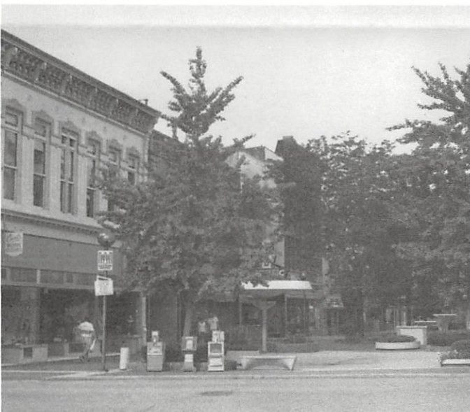
ISTEA brought communities back into transportation decisionmaking.

Though ISTEA has been a sterling success, there have been some difficulties.