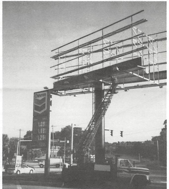
Charlotte will soon remove 180 billboards, as Jacksonville, above, is doing.

The real estate industry has for the last several years made a practice of placing signs in the right of way. These signs, in Maryland, Virginia, and many other states, are illegal. Marylanders opposed to the legislation noted the irony of changing the law to fit the desires of an industry which simply ignored it in any case.