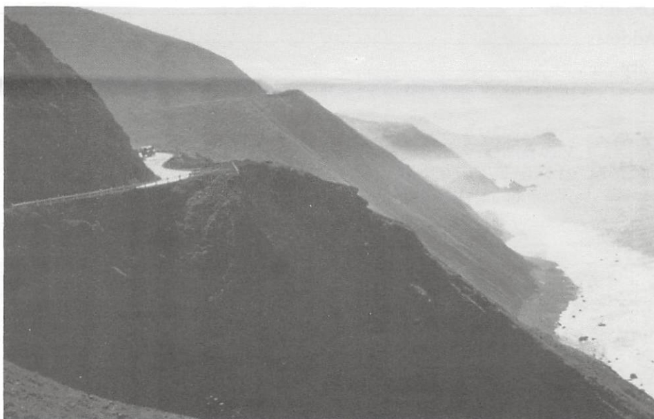
The Pacific Coast Highway is one of America's proudest scenic drives, providing inspiration for scenic conservation efforts nationwide. Members' support enables Scenic America to keep scenic byways free of visual pollution, preserving them for future generations.